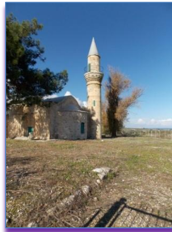
Chrysochous, near Polis